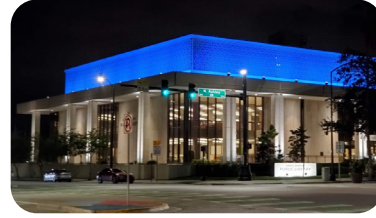
John F. Germany Public Library

You have access to a large variety of books, technology, and classes from the library's 29 locations, two mobile libraries, HCPLC.org website, and collaboration with the Temple Terrace and Plant City libraries.